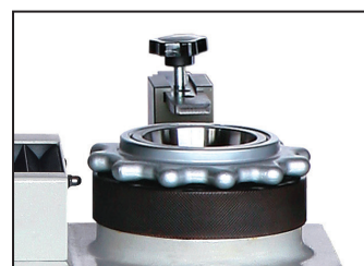
主軸座 Taper shank turning seat