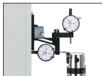
X軸、Z軸量錶 X-axis & Z-axis Gages

高精度・高效率 刀具預調儀專業設計・製造 Professionally Manufactured for tool pre-setter